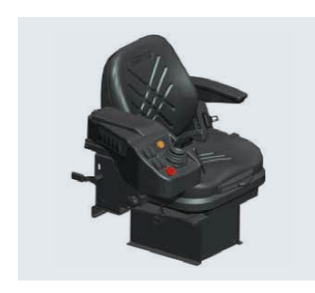
Suspended seat with fingertip system that can be easily adjusted to suit each customer.

/ Excellent all round visibility is achieved by the overall design. Meanwhile, the advanced, low-noise, ergonomic control arrangement and the standard cab with cooling and heating air conditioner improve the driving comfort, and can meet the driver's needs for long time and high intensity operation, no matter it is in summer or winter.