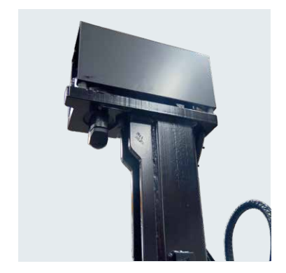
Improved design with built-in cabling and INNOVATION head. larger bending radius for hydraulic hose between pocket and end-post.